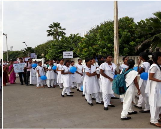
Walkathon WOHD 2018