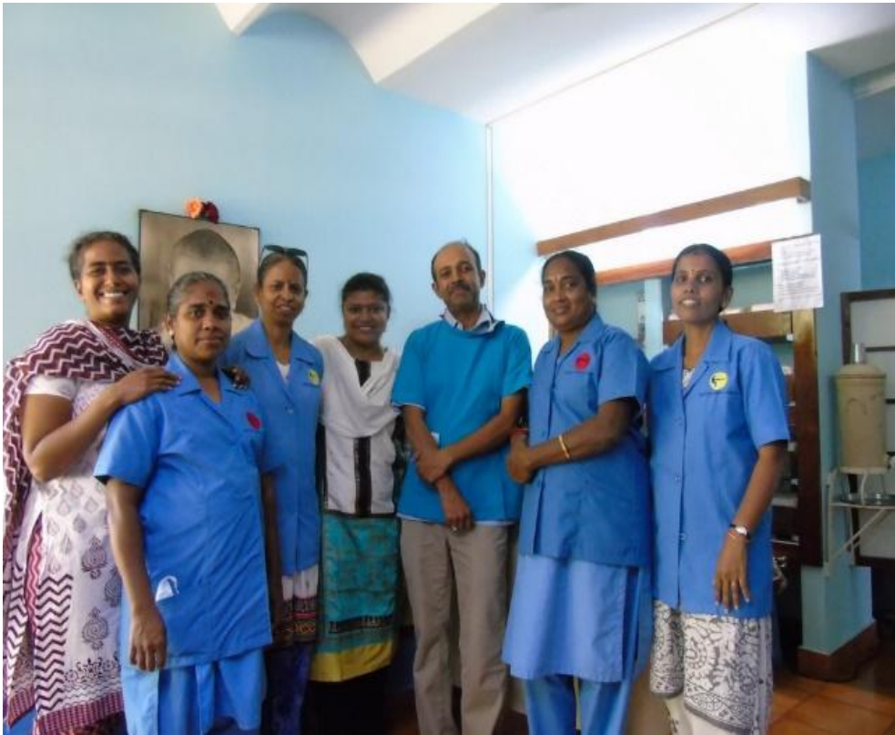
Training programme for dental surgeons and health workers on zero degree chair position