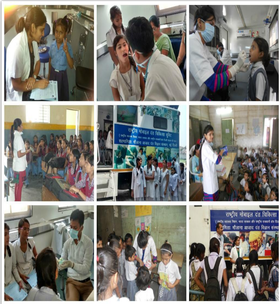
Screening and treatment camps in schools WOHD 2018