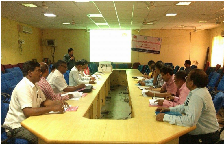
Training Programme for dental surgeons on Early Detection of Dental diseases