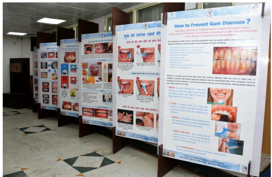
Exhibition organised at CDER AIIMS

The event was inaugurated by the Dean Academics. The exhibition was thrown open to the public and dentists were present at the venue for answering some of the common queries asked by them.