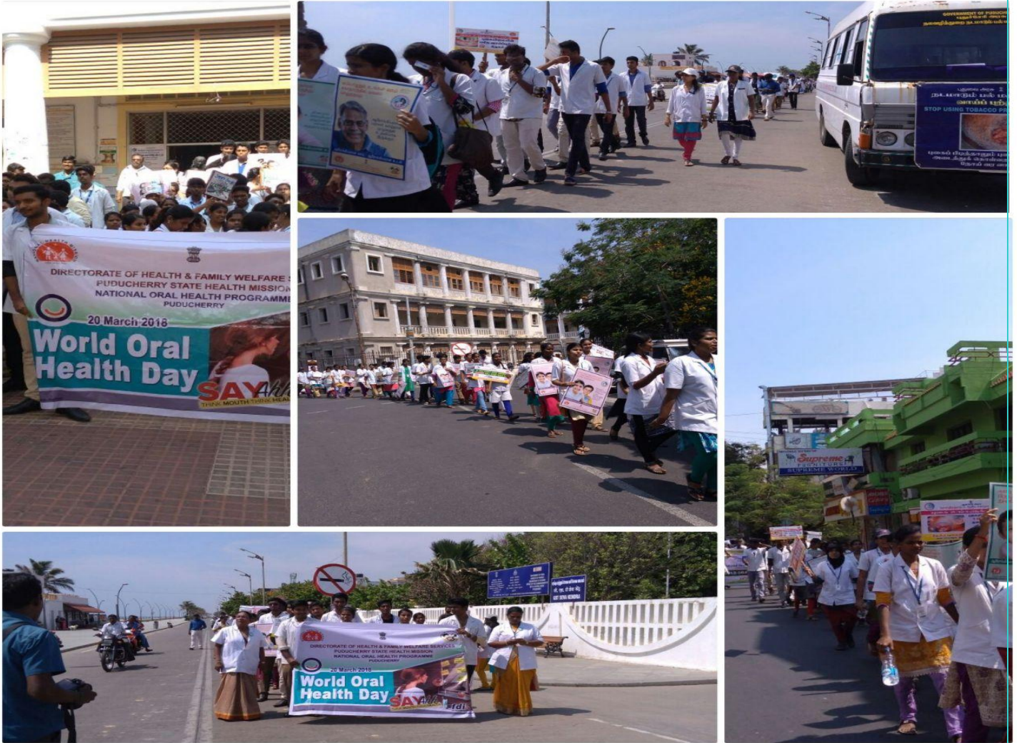
Various activities on WOHD 2018