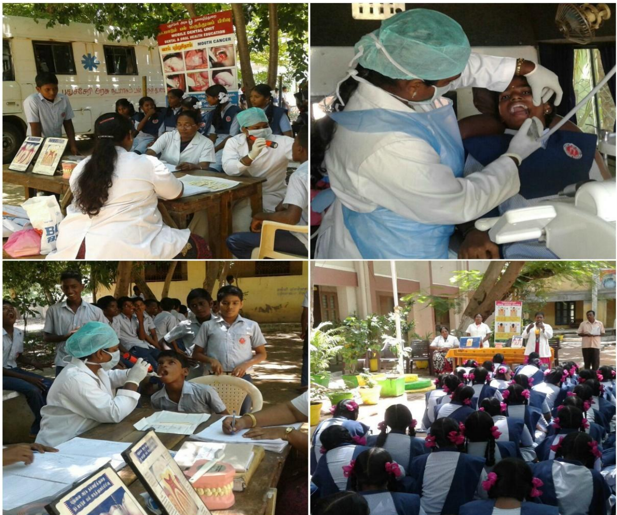
Screening and treatment camps WOHD 2018

This Union Territory is in the Southern most part of the peninsula. The responsible officer for oral health along with the Mission Directorate at the state organised a walkathon, a screening camp and various activities for both public as well as health care workers. Dentists received special training on Zero degree concept for treating the public at camp , school and outreach settings.