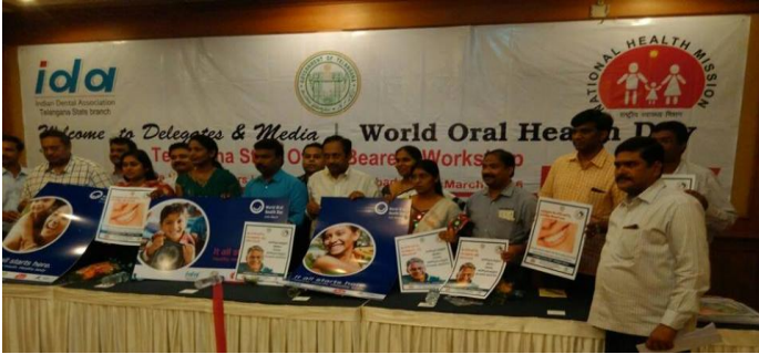
Translation of posters on oral health to local language and release of the same on WOHD 2018